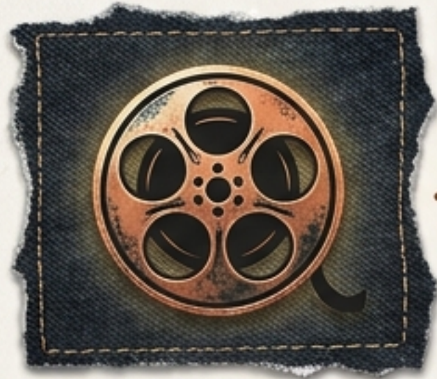
Scene 1: The Solitary Walk

Ponyboy leaves a Paul Newman movie alone. He wants company but knows walking alone is a bad idea.