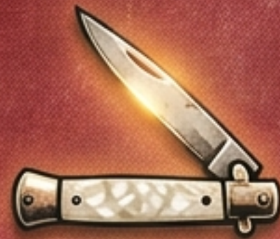
Scene 2: The Jump

Ponyboy leaves a Paul Newman movie alone. He wants company but knows walking alone is a bad idea.