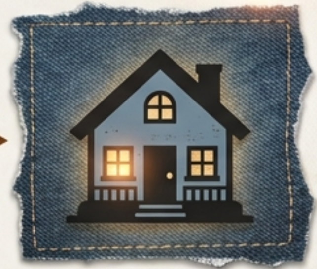
Scene 3: The Rescue

A red Corvair trails him. Five wealthy Socs surround and attack him.