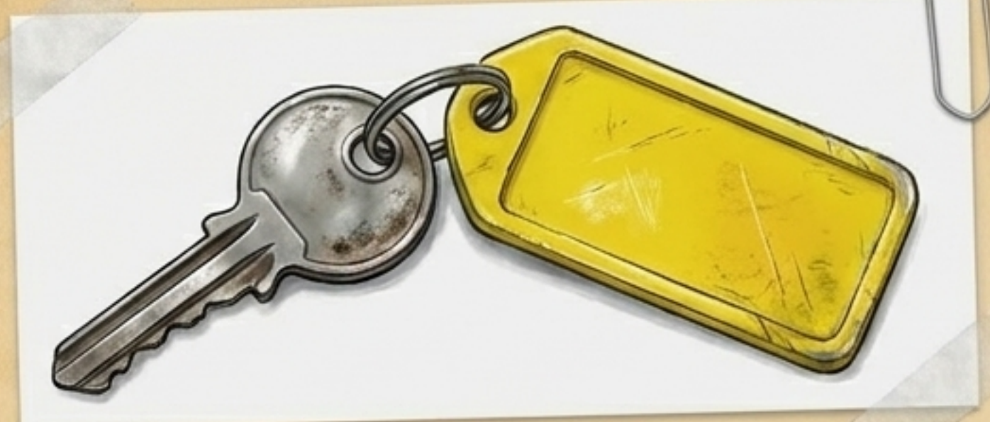
Exhibit B: The Yellow Key (Literal vs. Figurative)

Found with the wallet. Rat identifies it immediately: "This is a locker key for the left luggage. Just outside platform four... One-oh-one's small." (Rat, p. 30)